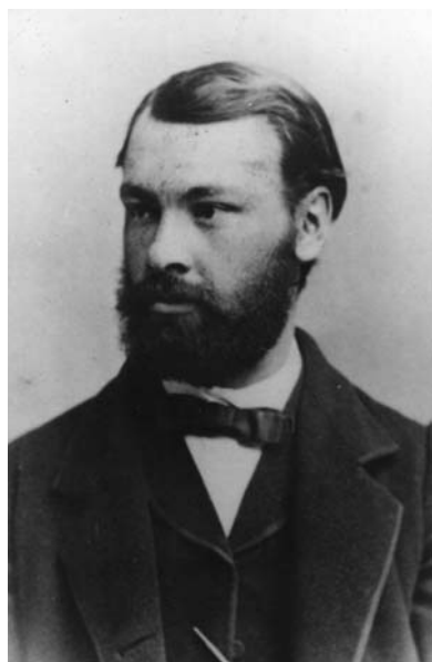
Viktor Knorre (1840–1919)

first, in order to find suitable accommodation for his family in Berlin, and finally settled down with them in the Prussian capital.